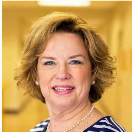
Becky Meadows Memorial Hospital Auxiliary Volunteer of the Year